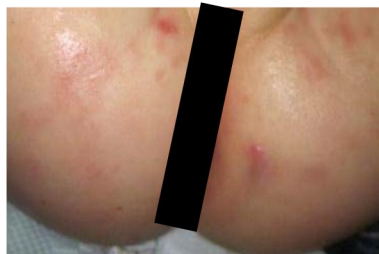
Figure 4. Toddler diaper rash (48 hours after PracaSil-Plus)

Caregiver Report: PracaSil-Plus was applied only twice in the first day and we still got amazing results. It worked so quickly – it took away the pain almost immediately. We are very happy!