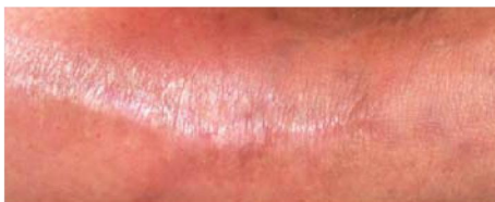
Figure 2. Patient old ankle scar (one week after PracaSil-Plus)

Patient Report: In only one week I had incredible improvements in the overall appearance of my scars. The thickness almost completely disappeared, the dark color faded and the skin softened. I am very impressed with the results obtained.